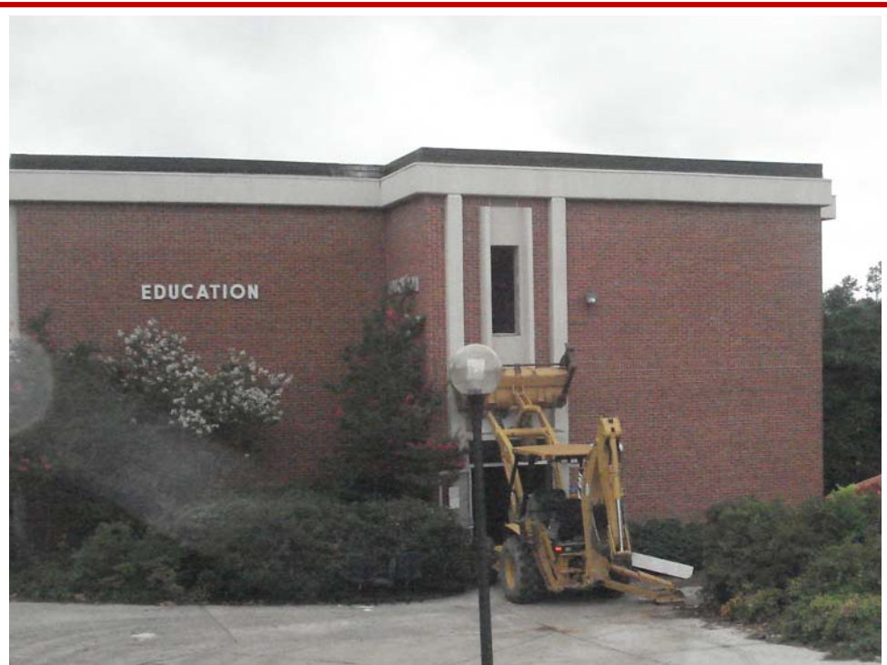
A bulldozer is about to begin the demolition of the Education Building, the former home of the RESA offices.

The RESA offices are now located in the Learning Support Building on the first floor, room 126. This building houses the auditorium and is next to the newly built Jones Building. Plans are for RESA to be there for approximately two years.